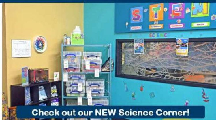
Check out our NEW Science Corner!